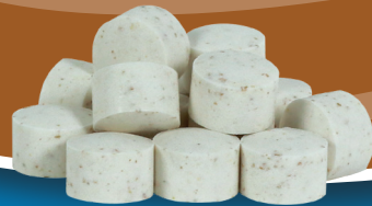
Precision Release Pellets

BENEFICIAL BACTERIA Eliminates Mucky Bottoms